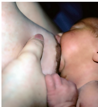
© B. Wilson-Clay/K. Hoover, from The Breastfeeding Atlas , 2008. Used with permission.